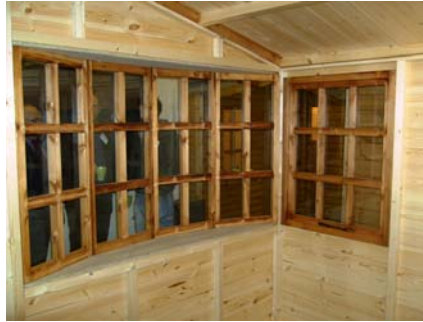
Layland internal view