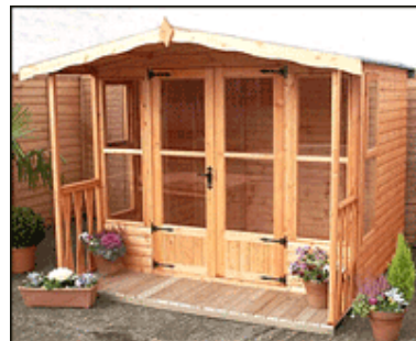
Waendel with Balcony

All summerhouses are manufactured 5" T&G as standard unless specified otherwise and are supplied with black antique ironmongery and a five lever lock. Balconies are available as an optional extra. Loglap = 10% extra. (Ref: 0412091755)