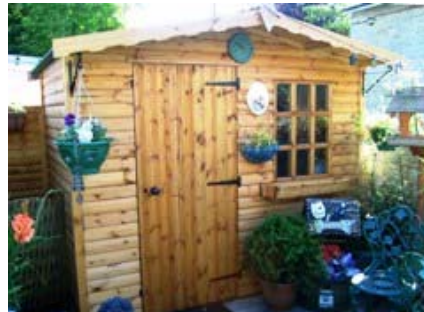
Euro Chalet-Log Lap

All summerhouses are manufactured 5" T&G as standard unless specified otherwise and are supplied with black antique ironmongery and a five lever lock. Balconies are available as an optional extra. Loglap = 10% extra. (Ref: 0412091755)