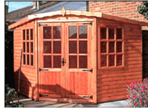
Whytewell – Corner Summerhouse