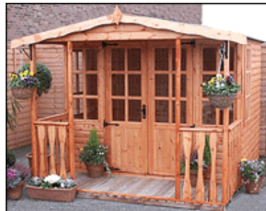
Barton with Balcony