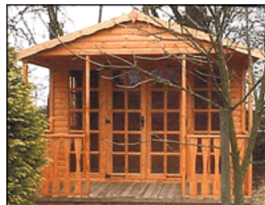
Wilbye with 4' Balcony

All summerhouses are manufactured 5" T&G as standard unless specified otherwise and are supplied with black antique ironmongery and a five lever lock. Balconies are available as an optional extra. Loglap = 10% extra. (Ref: 0412091755)