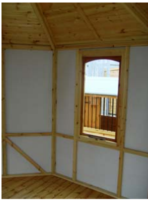
Brampton Internal of Rear window.